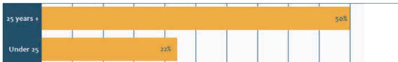
Figure 3: Plans to apply for permanent residency following